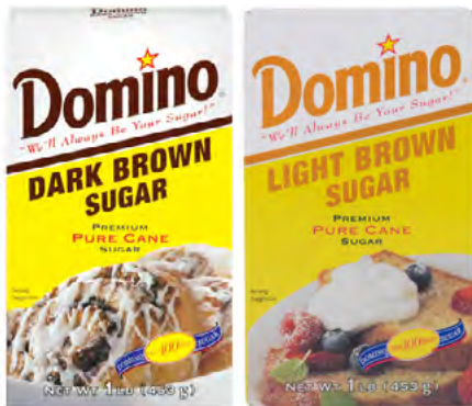
Domino Dark/Light Brown Sugar

1 LB; 24/CS #DM1P 2 LB; 24/CS #DM2P 4 LB; 10/CS #DM4P 10 LB; 4/CS #DM10P