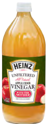
Heinz Cider Vinegar 16 OZ; 12/CS #VINCIDER16