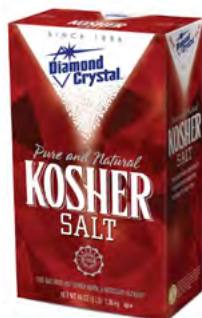
Kosher Diamond Salt