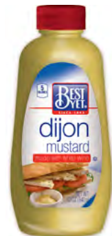
Best Yet Dijon Mustard 4 LB; 6/CS #MUBY12