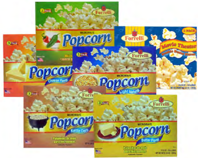
Assorted Best Yet Popcorn 9.9 OZ; 12/CS; #POPHY