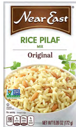
Near East Rice Pilaf 6.9 OZ; 12/CS #RINEPILAF