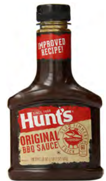
Assorted Hunt's BBQ 18 OZ; 12/CS #SABBQH