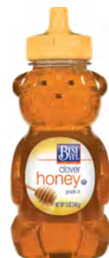
Best Yet Honey 12 OZ; 12/CS #HOBY12