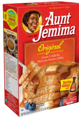
Aunt Jemima Pancake Mix 2 LB; 12/CS #PMAJ2 16 OZ; 12/CS #PMAJ16