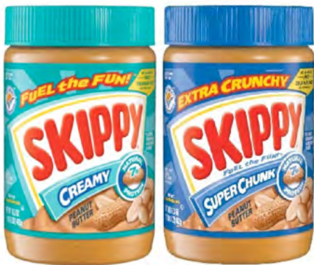
Assorted Skippy Peanut Butter 16.3 OZ; 12/CS #PBSKIP