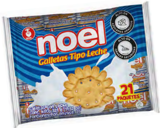
Galleta Tipo Leche Bag 11.32 OZ; 24/CS #CRGTIPO