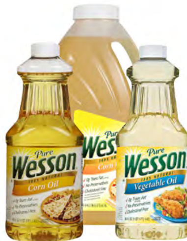
Wesson Corn Oil 48 OZ; 9/CS #OCWE48 64 OZ; 9/CS #OCWE64 128 OZ; 4/CS #OCWE128