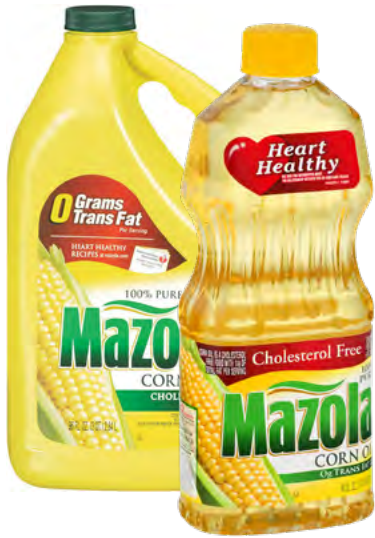
Mazola Pure Corn Oil 16 OZ; 12/CS #OCMA16 24 OZ; 12/CS #OCMA24 40 OZ; 12/CS #OCMA40 96 OZ; 6/CS #OCMA96