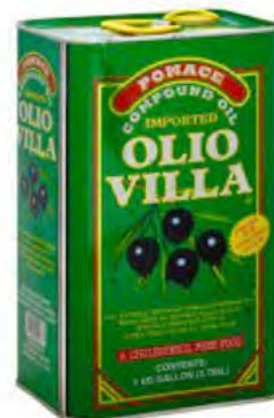
Olivo Villa Olive Oil 128oz; 4/CS; #OO128