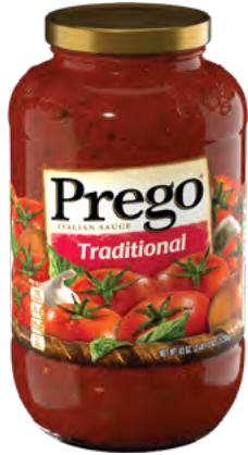
Prego Sauce 24 OZ; 12/CS #TOPREGO24