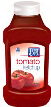
Best Yet Ketchup 24 OZ; 16/CS #KEBY24