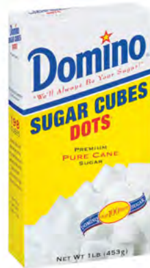
Domino Sugar Cubes