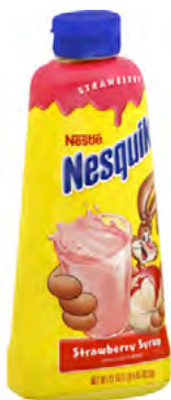
Assorted Nestle Syrup (Chocolate, Strawberry) 22 OZ; 12/CS #SYNES