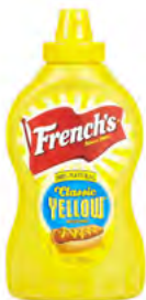
French's Mustard 8 OZ; 20/CS #MUFRSQ8 14 OZ; 16/CS #MUFRSQ14