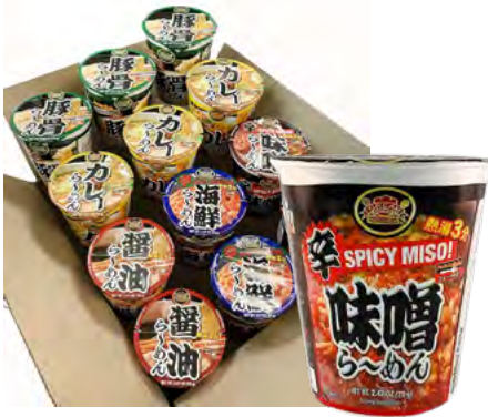
XX OZ; XX/CS #SACUP