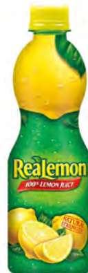
Real Lemon Juice 8 OZ; 12/CS #LJREAL8 32 OZ; 12/CS #LJREAL32