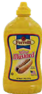
Forelli Mustard 12 OZ; 12/CS #MUFAYOS