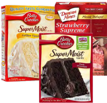
Assorted Cake Mix (Vanilla, Chocolate, Strawberry) 15.25-18.25 OZ; 12/CS #CMDH #CMBC