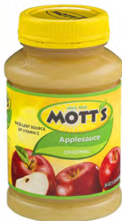
Mott's Applesauce 24 OZ; 12/CS #FRASMO