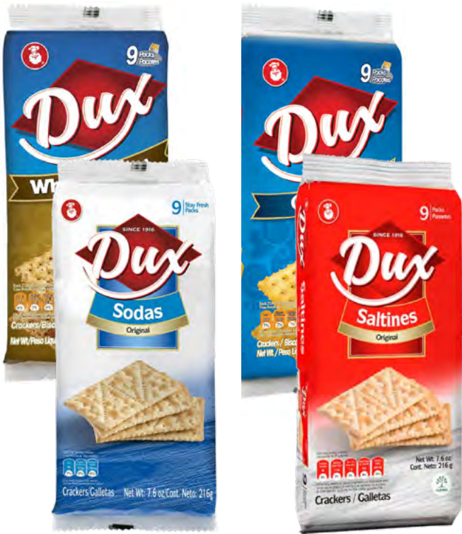
Dux Club Original Crackers Bag 8.82 OZ; 24/CS; #CRDXCOR