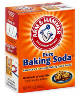
Arm & Hammer Baking Soda