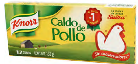
Knorr Chicken Seasoning

6 CT; 24/CS #SPKNOR6 24 CT; 36/CS #SPKNOR24