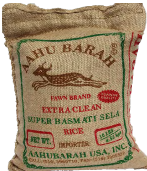
Aahu Barah Basmati Rice 10 LB; 4/CS #BRAB10 20 LB; 2/CS #BRAB20 40 LB; 1/CS #BRAB40