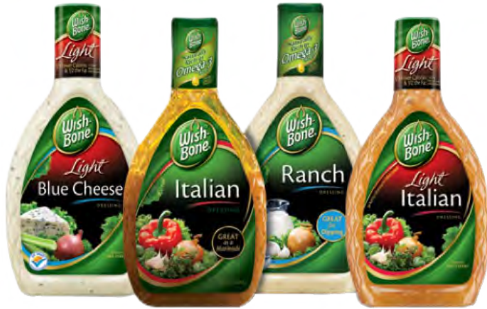
Wishbone Salad Dressing 8 OZ; 12/CS #DRWI8/12