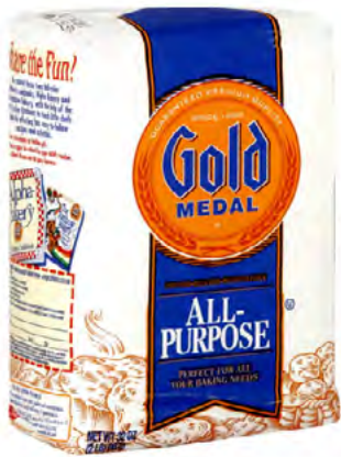
Gold Medal All Purpose Flour