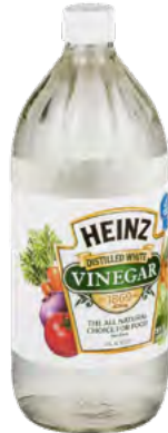
Heinz White Vinegar 16 OZ; 12/CS #VINHEI16