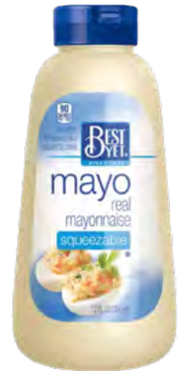
Best Yet Mayo Squeezable: 12 OZ 12/CS #MABY12 In a Jar: 30 OZ 12/CS #MABY30