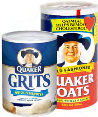
Quaker Old Fashioned Oats 18 OZ; 12/CS #OATSQ Quaker Quick Grits 24 OZ; 12/CS #GRITQ