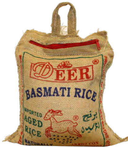
Deer Basmati Rice 20 LB; 1/CS #BRDB20 Deer White Basmati Rice 10 LB; 1/CS #BRDEW10 Sela Rice Golden Basmati Rice 20 LB; 2/CS #BRDS20 10 LB; 4/CS #BRDS104