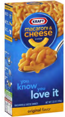
Kraft Mac & Cheese 5.5 OZ; 24/CS #MCKRAFT5