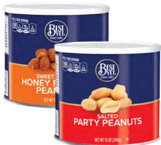
Assorted Best Yet Roasted Peanuts (Salted, Unsalted, Roasted) 12 OZ; 12/CS #NYBY12