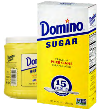
Domino Pure Cane Sugar

1 LB; 24/CS #DM1P 2 LB; 24/CS #DM2P 4 LB; 10/CS #DM4P 10 LB; 4/CS #DM10P