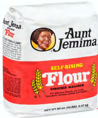
Aunt Jemima Self Rise Flour