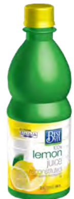
Best Yet Lemon Juice 32 OZ; 12/CS #LJBY32