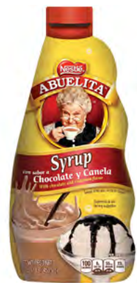
Nestle Abuelita Syrup 15.9 OZ; 12/CS #SYNESABU