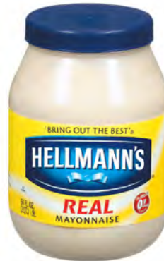
Hellmann's Mayonnaise 8 OZ; 12/CS #MAHE8 15 OZ; 12/CS #MAHE15 30 OZ; 15/CS #MAHE30 Squeeze Bottle 9 OZ; 12/CS #MAHE9