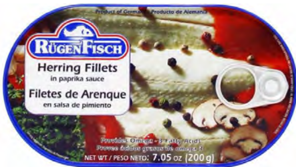
Herring in Paprika Sauce 7.05 OZ; 32/CS #FIRUPA