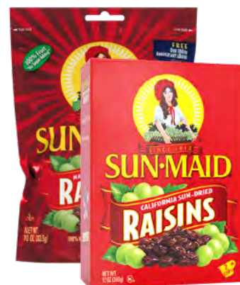
Sun-Maid Raisins 12 OZ; 24/CS #FRA12 10 OZ Bag; 12/CS #FRA10