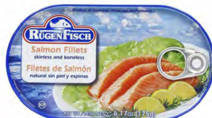
Skinless Boneless Salmon 6.17 OZ; 32/CS #FISASM