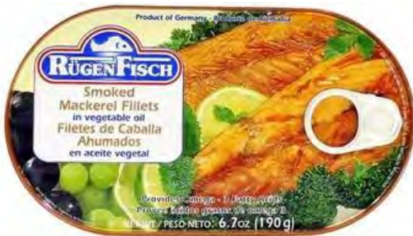
Smoked Mackerel 6.7 OZ; 32/CS #FIMAVE