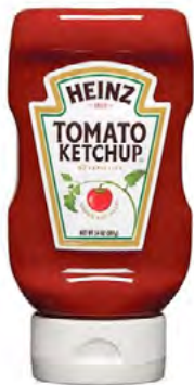
Heinz Ketchup Squeeze 20 OZ; 12/CS #KEHEI20