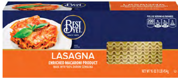
Best Yet Lasagna 16 OZ; 12/CS #PASBYLA