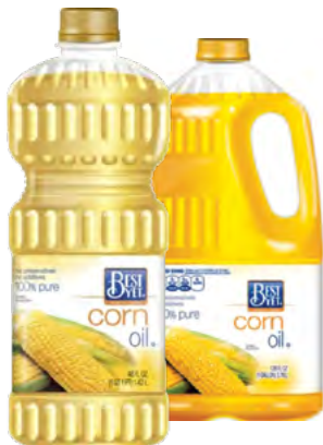
Best Yet Corn Oil 128OZ; 4/CS #OCBY128 48OZ; 9/CS #OCBY48