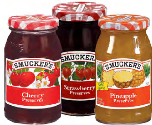
Smuckers Preserves 12 OZ; 12/CS #JAMSMU