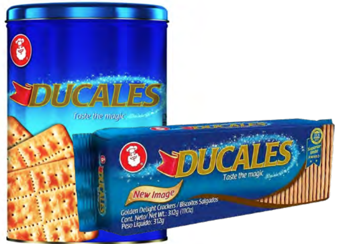
Ducales Crackers 24 CT; 10.37 OZ; #CRDUCAP