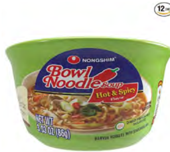
XX OZ; XX/CS #SABOWL