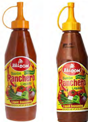
Rancho Liquid Seasoning 15.5 OZ; 24/CS #MBFS15 29 OZ; 12/CS #MBFS29