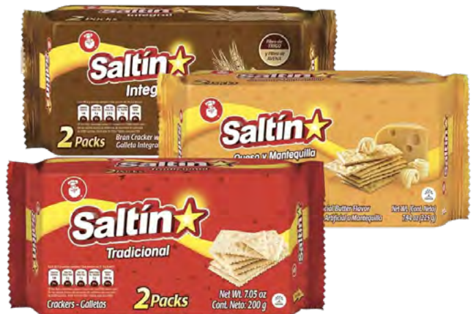
Saltin Noel Crackers