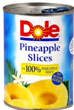
Dole Pineapple Slices 20 OZ; 12/CS #FRPASL