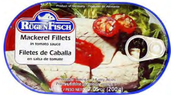
Mackerel in Tomato Sauce 7.05 OZ; 32/CS#FIMATO