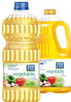
Best Yet Vegetable Oil 128OZ; 4/CS #OVBY128 48OZ; 9/CS #OVBY48