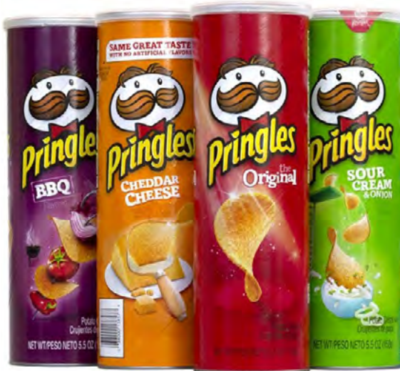
Assorted Pringles 5.71 OZ; 14/CS #PRINGLES