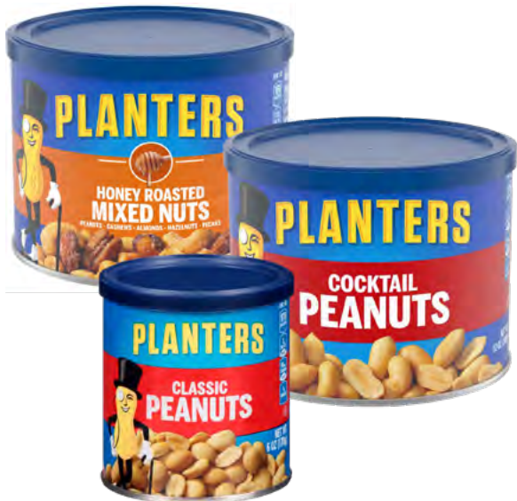
Planters Peanuts (Honey Roasted, Cocktail, Classic) 12 OZ; 12/CS #NUPLCO