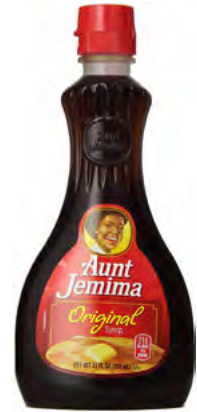
Aunt Jemima Pancake Syrup 12 OZ; 12/CS #SYAJ12 24 OZ; 12/CS #SYAJ24