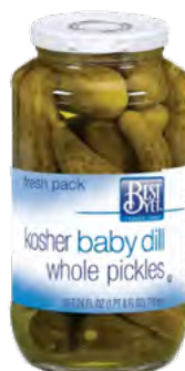
Best Yet Kosher Baby Dills 16 OZ; 12/CS #PIBYDILLS