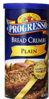
Progresso Bread Crumbs