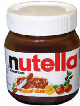
Nutella Chocolate Hazelnut Spread 13 OZ; 15/CS; #CSNUTE13