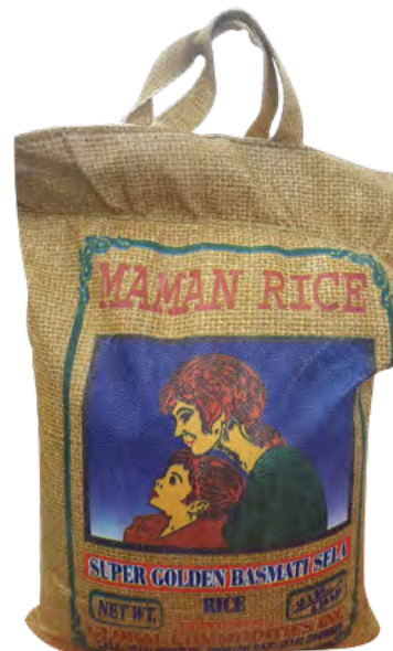
Maman Basmati Rice 20 LB; 2/CS #BRMA20 10 LB; 4/CS #BRMA10