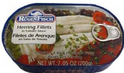
Herring in Tomato Sauce 7.05 OZ; 32/CS #FIRUTO