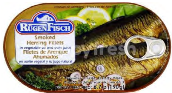
Smoked Herring Fish 6.7 OZ; 32/CS #FIRUSM