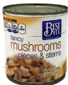
Best Yet Mushroom Stems & Pieces 4 OZ; 24/CS #CFMUBY