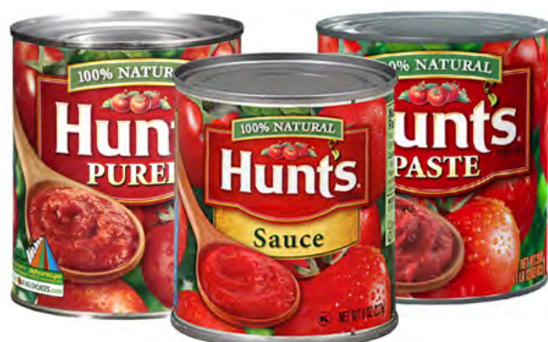
Hunt's Tomato Sauce 8 OZ; 48/CS #TOHUSA8 29 OZ; 12/CS #TOHUSA