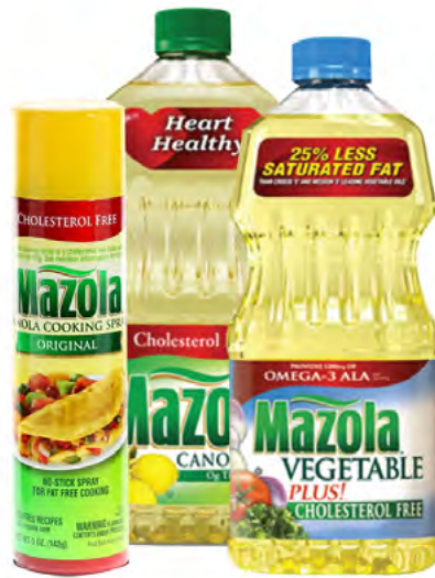
Mazola Oil 40 OZ; 12/CS Canola Oil #CAMAZO40 Vegetable Oil #OVMA40 Nonstick Cooking Spray 5 OZ; 12/CS #CSMAZ