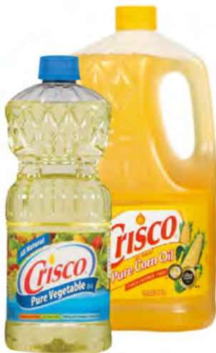
Crisco Oil Corn: 40 OZ; 9/CS #OCCR48 Corn: 128 OZ; 4/CS #OCCR128 Canola: 32 OZ; 9/CS #OCACR32