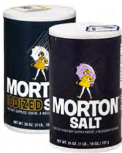
Mortan Salt (Plain, Iodized)