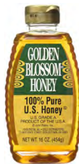
Golden Blossom Honey 8 OZ; 24/CS #HOGB8 12 OZ; 12/CS #HOGB12