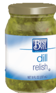
Best Yet Relish (2 Kinds) 8 OZ; 12/CS #REBY8