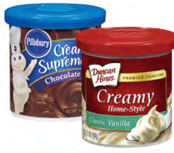
Assorted Cake Frosting (Vanilla, Chocolate) 16 OZ; 8/CS #CFBC