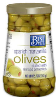
Best Yet Manzanilla Olives 5.75 OZ; 12/CS #OLIBY