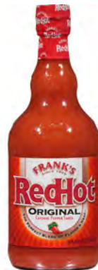
Frank's Red Hot Sauce 12 OZ; 12/CS #HSFR12 5 OZ; 24/CS #HSFR5